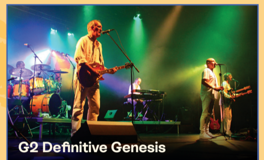
G2 Definitive Genesis