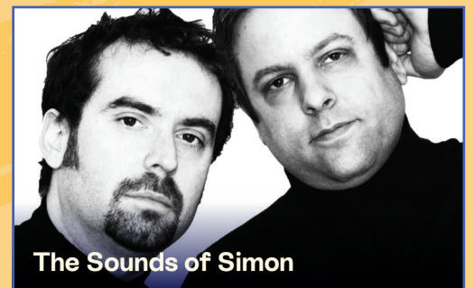
The Sounds of Simon