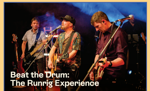
Beat the Drum: The Runrig Experience

Fri 11 Jul, 8pm – £23.50 / £21.50 conc Beatles Complete present a night of Beatlemania packed with massive hits from the most influential band of all time.