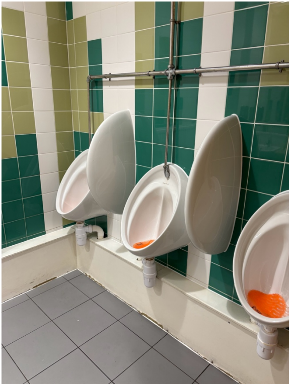
Two sinks on the left...