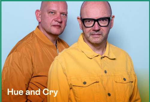
Hue and Cry

Thu 16 May, 8pm – £18 Hailing from the oldest settlement west of the Rocky Mountains - Astoria on the big Columbia River - The Hackles are an impressive American trio showcasing sumptuous vocal harmonies and song-writing.