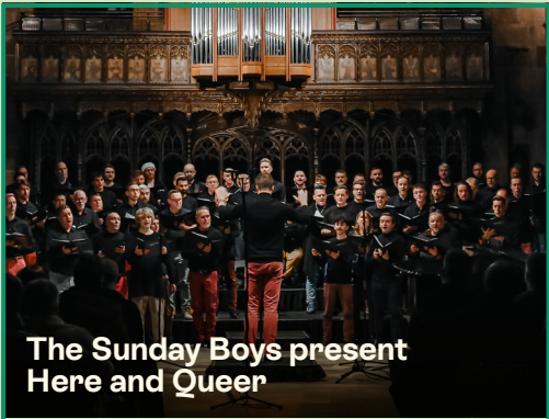
The Sunday Boys present Here and Queer

Sat 13 Jul, 8pm – £20 advance / £22 door This nine-piece band meticulously recreate the very best from the catalogues of Stax, Atlantic, Motown, and Northern Soul plus tributes to James Brown and The Blues Brothers. The ultimate Soul Party!