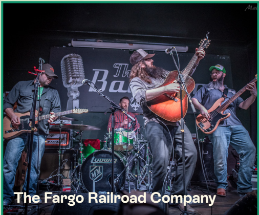
The Fargo Railroad Company