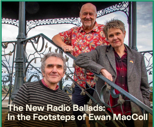
The New Radio Ballads: In the Footsteps of Ewan MacColl