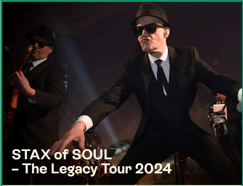
STAX of SOUL – The Legacy Tour 2024

Fri 12 Jul, 8pm – £17 standing / £19 seated Yorkshire’s very own tribute to the Arctic Monkeys with an authenticity that is hard to beat.