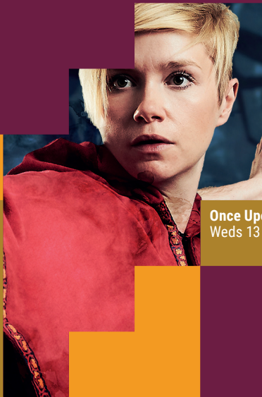
Once Upon a Time... Weds 13 Nov, 8pm