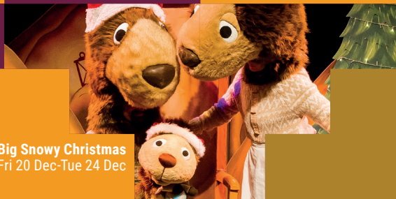
The Big Snowy Christmas Fri 20 Dec-Tue 24 Dec

the met f metbury @ metbury Buy tickets direct from themet.org.uk 0161 761 2216